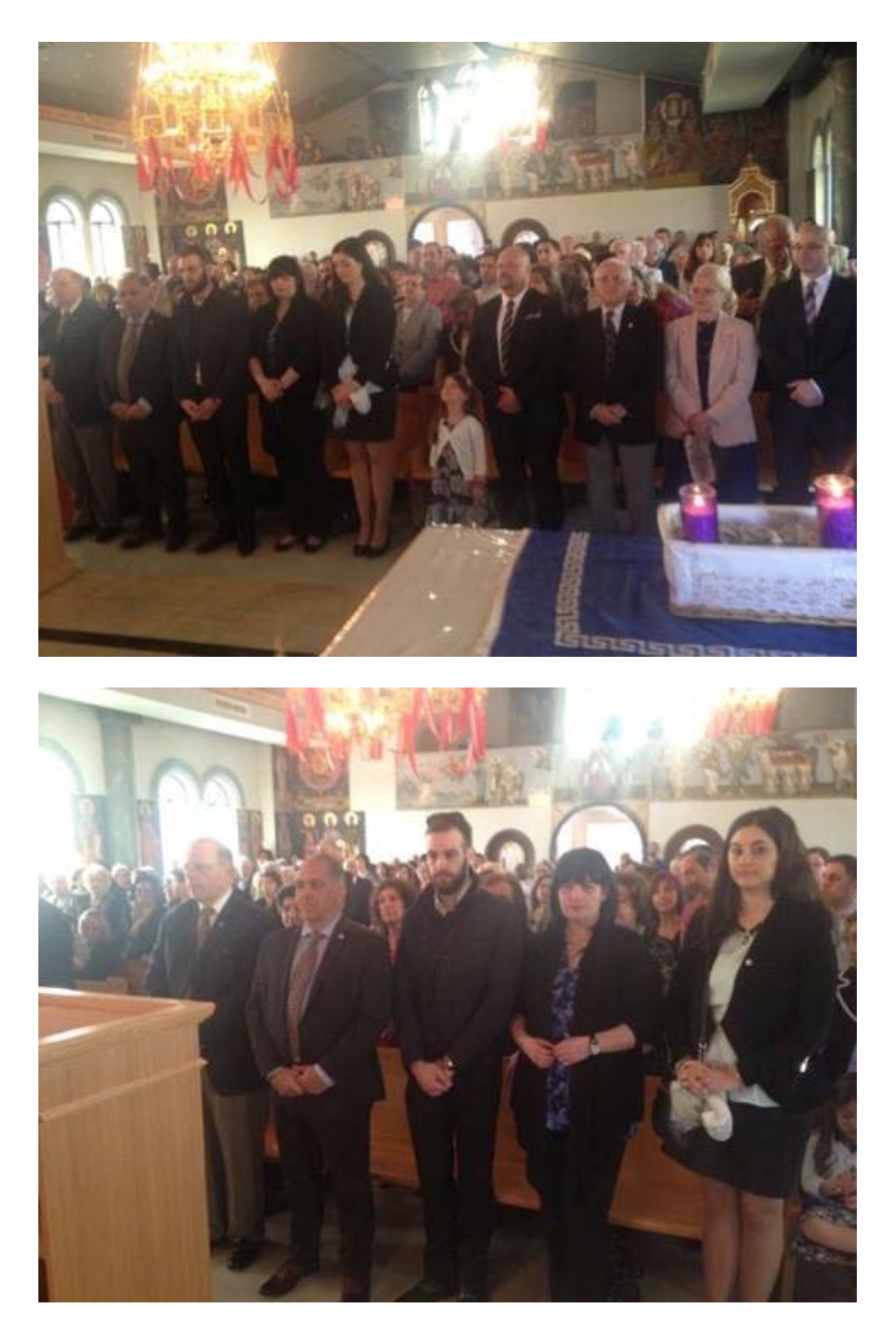
The leaders of all four Orders of the AHEPA Family in Attendance