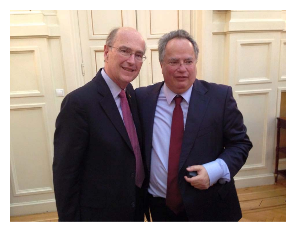
With the Greek Minister of Foreign Affairs Nikos Kotzias.