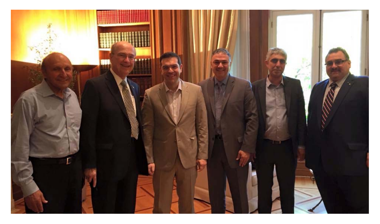
With the Prime Minister of Greece Alexis Tsipras