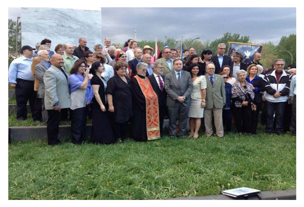
Montreal AHEPA Family members attended in large numbers the 98<sup>th</sup> Commemoration of the Greek Pontian Genocide at Montreal's Genocide Memorial on May 19<sup>th</sup>, 2015