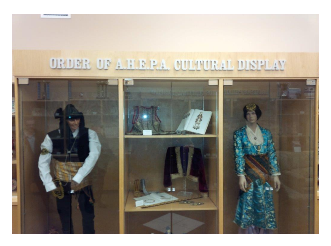
The AHEPA Winnipeg Family Raised over $100,000 towards the Winnipeg Hellenic Community Centre were it now has a cultural and archival display, office and meeting rooms. The fruits of cooperation between the Church and AHEPA.