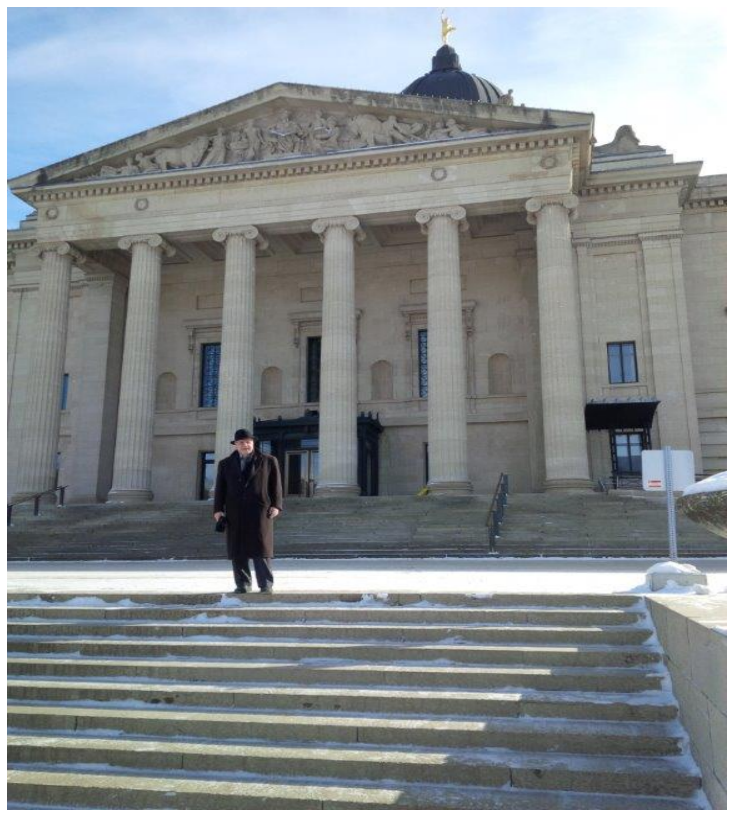
From our visit to Manitoba's beautiful neoclassical Legislative Building