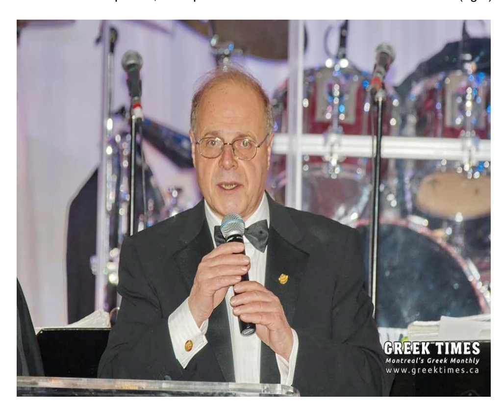
Your Canadian President addressing the 250 guests in attendance