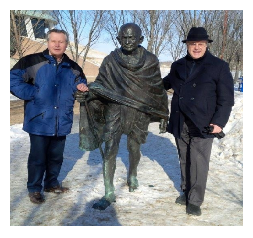
An inspirational walk with Mahatma Gandhi, outside Canada's newest museum, The Museum of Human Rights in Winnipeg, Manitoba