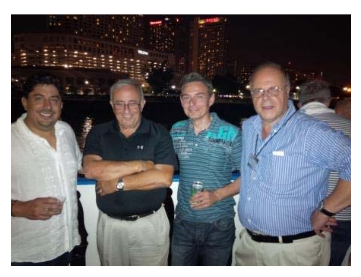
From New Orleans Supreme Convention, July 2014