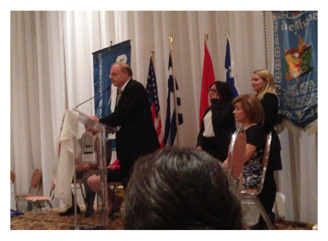
Montreal AHEPA Family Installation Ceremony, October 3, 2014