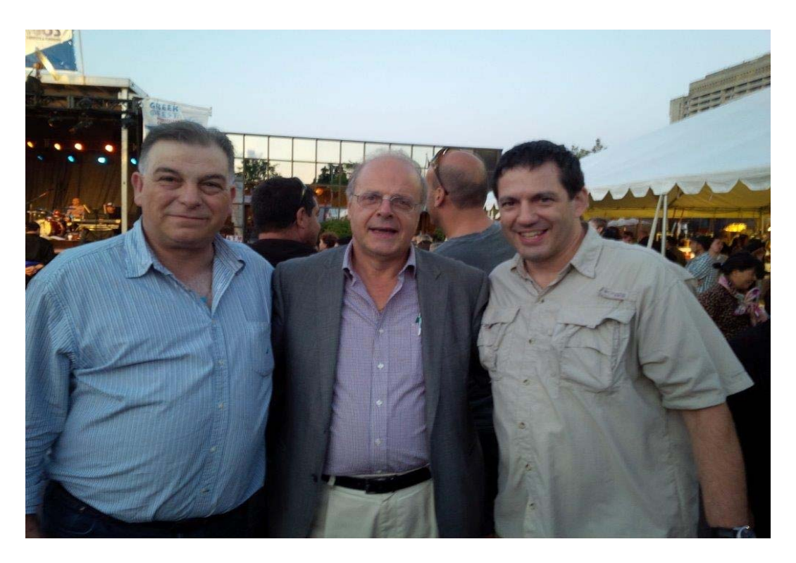
With AHEPA Chapter Brothers in Ottawa Greek Fest August 17, 2014