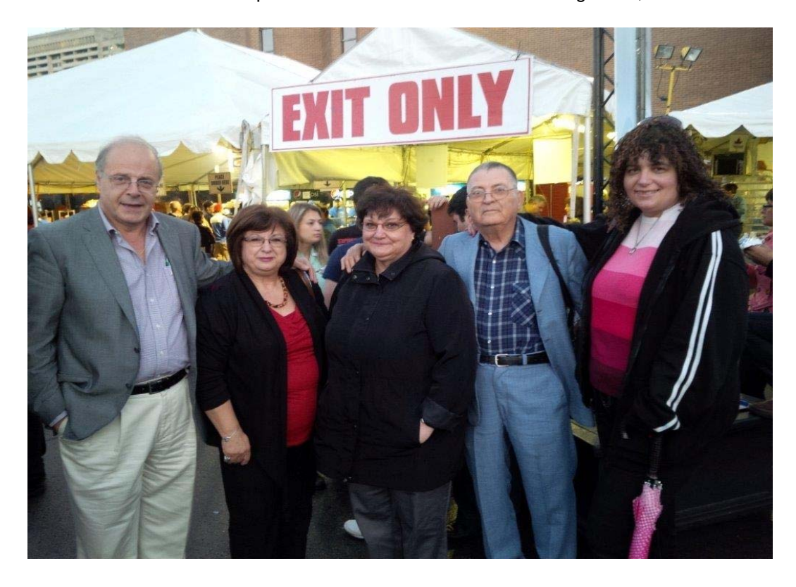
With Montreal Daughters at Ottawa Greek Fest, August 17, 2014