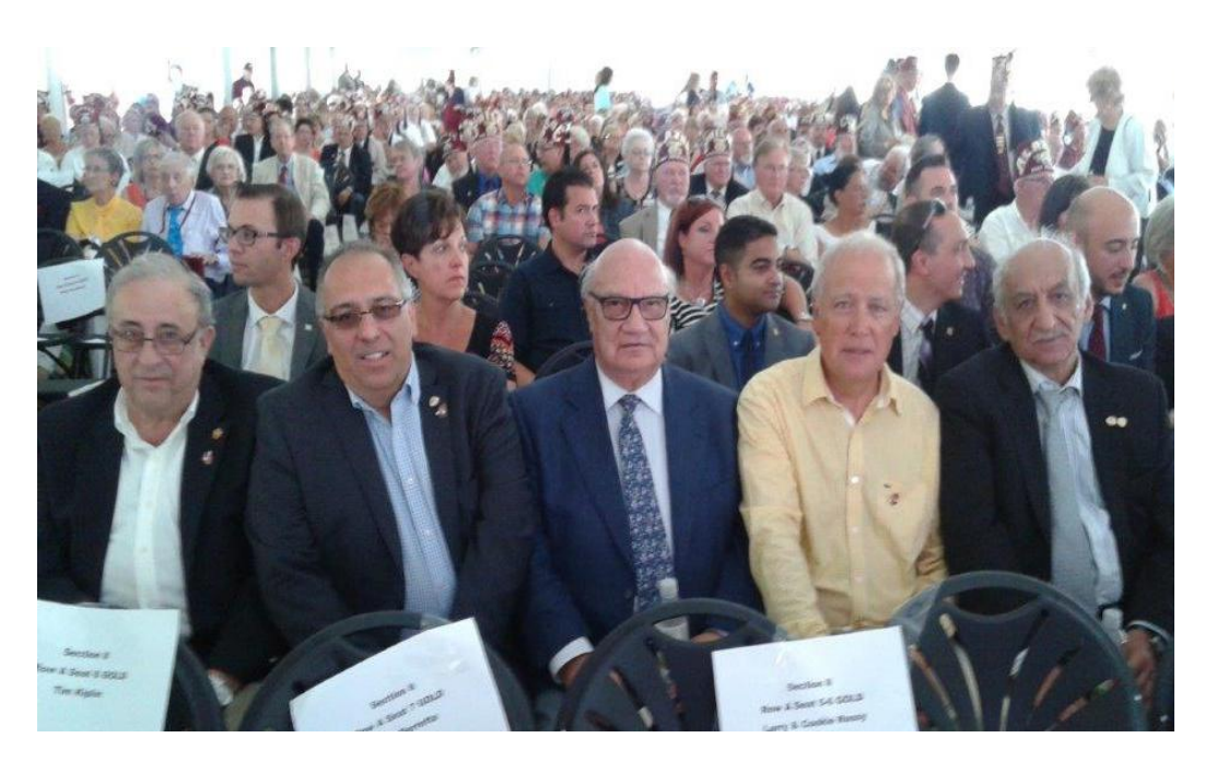
AHEPA Montreal Chapter contributed $250,000 towards this noble objective and the Shriners have named the School in the hospital the "AHEPA Family School"