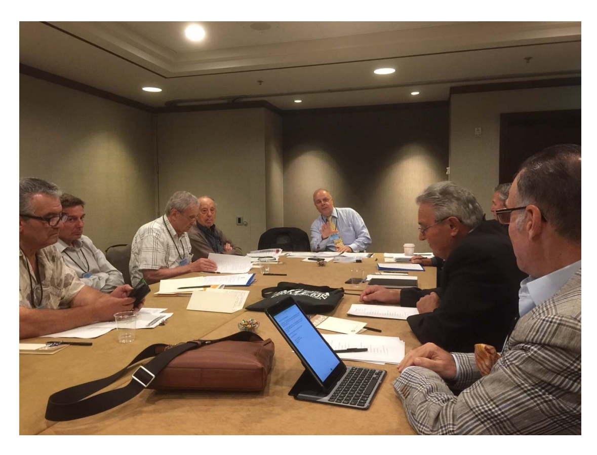
Canadian Affairs Committee Meeting at the Convention