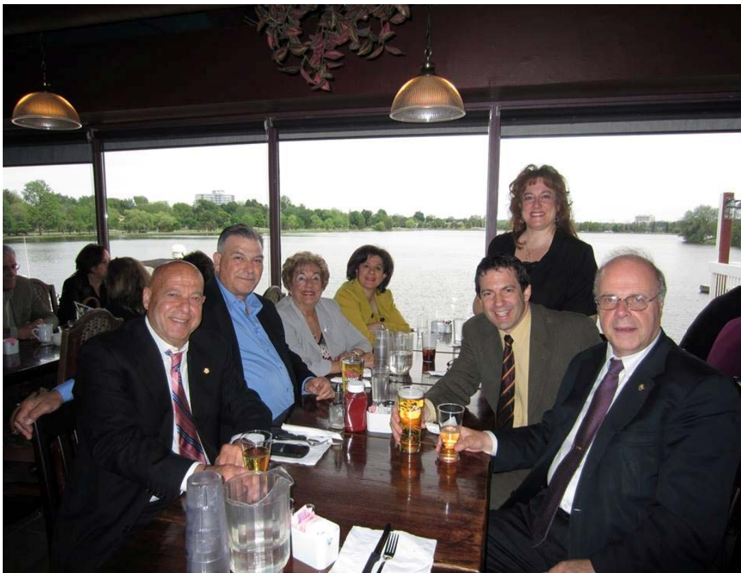
Having lunch at Malone's Restaurant, overlooking the Rideau Canal