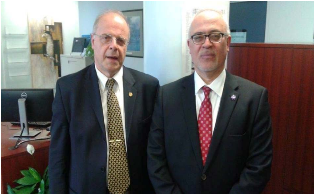
Canadian President of AHEPA with the Honourable Carlos Leitao, Finance Minister of Quebec