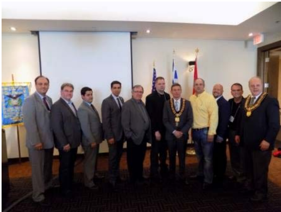
The newly installed AHEPA District #23 Lodge following the Swearing in Ceremony