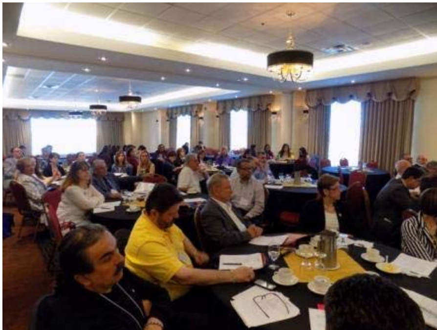
Delegates attending the morning session