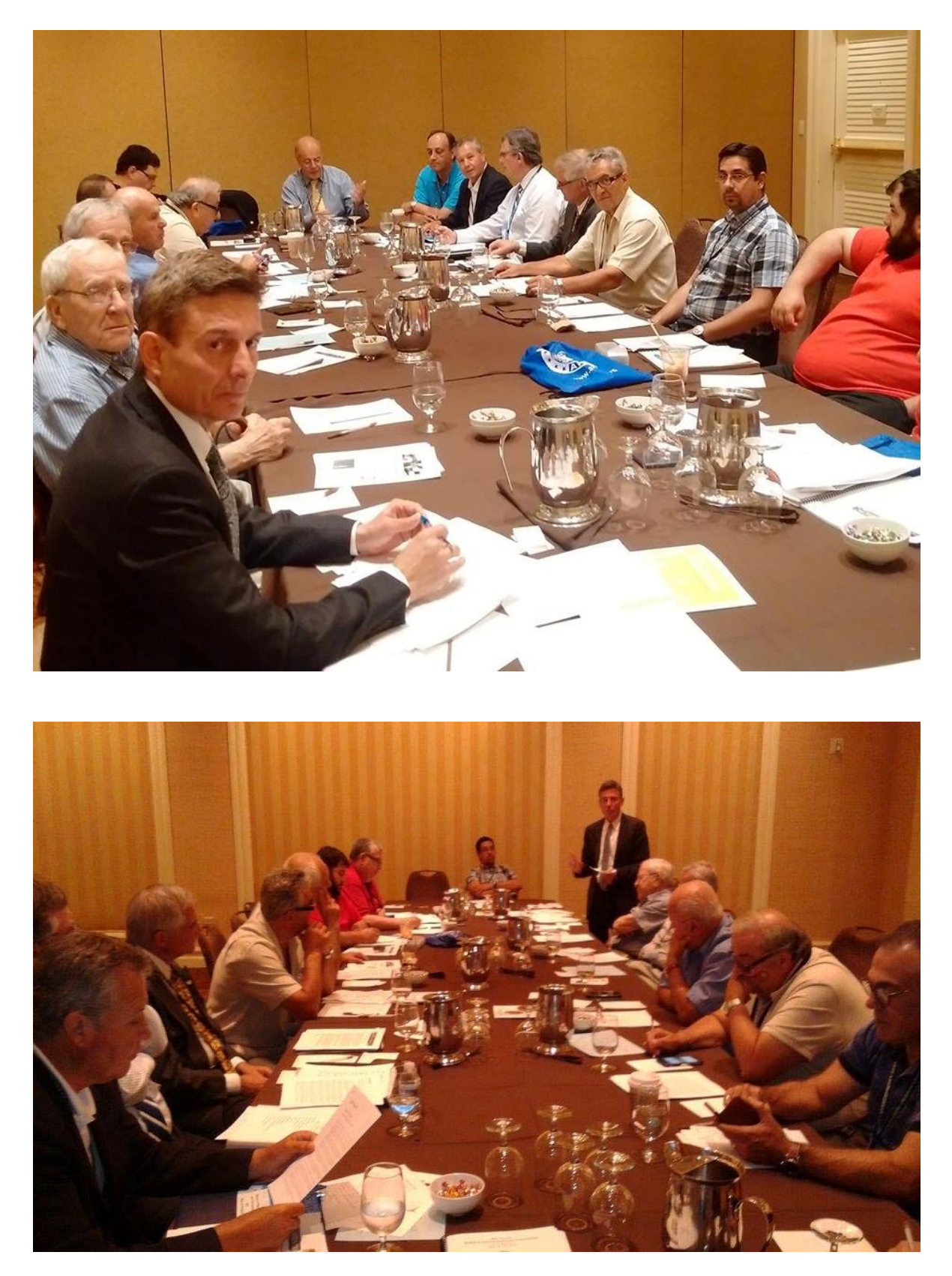
From the deliberations of the Canadian Affairs Committee at the Supreme Convention