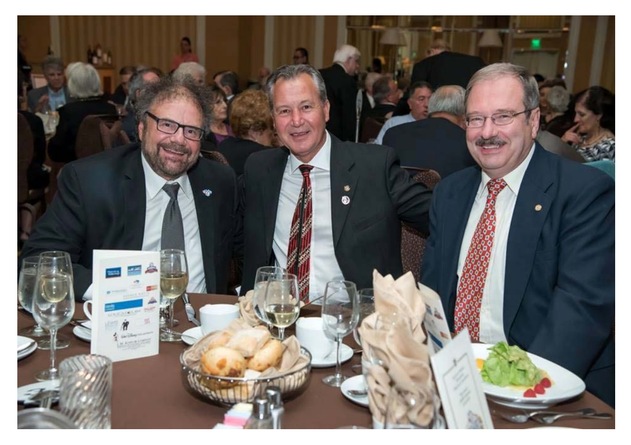
District 24 Governor Christos Argiriou seated in the center at the Convention banquet