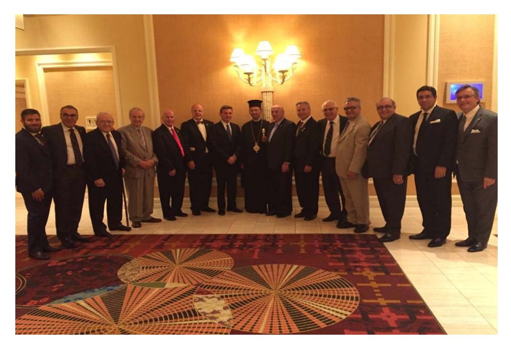
The Canadian delegation at the Supreme Convention in Las Vegas with His Eminence Metropolitan Gerasimos of San Francisco in the center