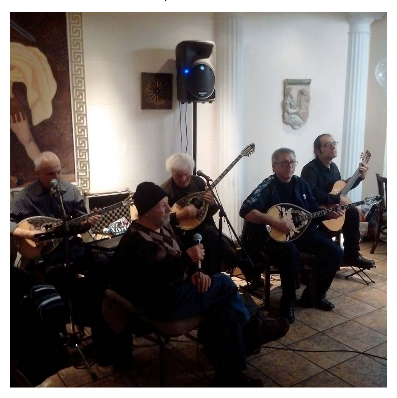
Toronto AHEPA Family Christmas Dinner, December 3, 2016