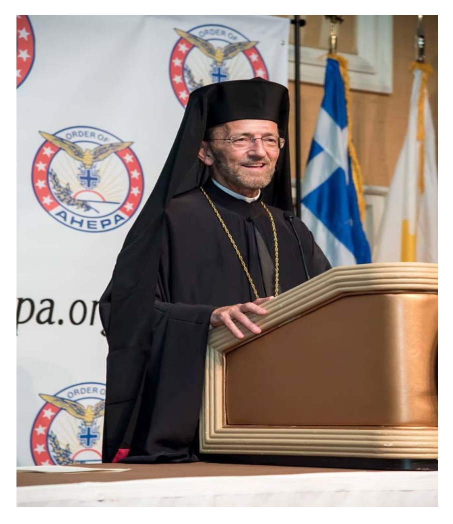
His Eminence Metropolitan Gerasimos of San Francisco addressing the Banquet delegates